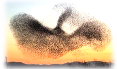
A starling murmuration

It's me, Ms. Stark, the S in 5 S P. Actually, the S could stand for 5 S cientists because we'll do A LOT of science this year. The S might also stand for 5 S tarlings. Starlings are a type of bird and 5 th graders in Brookline do a unit called Bird Sleuths . It allows us to be scientists inside and outside of school. School should include the great outdoors, don't you agree? Starlings are amazing because they can form a massive starling cloud called a murmuration . If you want to see a murmuration in action, copy and paste this link from our new and nifty webpage into your browser. http://stark5spwebsite.weebly.com/super-science-2016-17.html Soon, the website will also include stories, podcasts, and other information written and produced by you. It will also have this letter and the supply list on it in case you lose or spill something on this one.